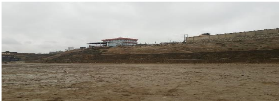
Figure 4. Historical view of Buzkashi hill, Kunduz province

This hill remains from different historical periods and is located five kilometers southeast of Kunduz Province, in the middle of which is Buzkashi Square. The range of these hills extends to Khanabad and Kandahari plains.