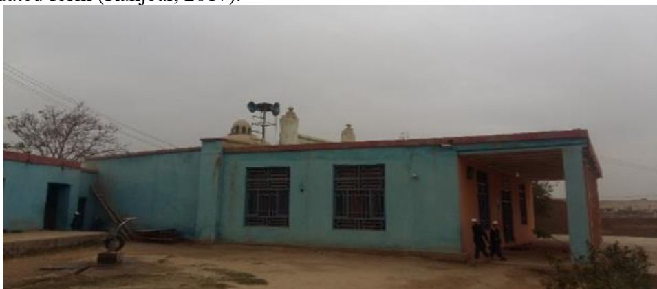
Figure 11. View of Saqibai Masjid

Saqibai School is located in the old city of Kunduz, facing the sun, in the end of Ahangari village. The mentioned school has four corners and shape of square, made of baked clay, plaster and lime materials, portico and dome, in the architectural style of the Timurid era of Herat. It was built on three sides of the school, namely, north, south and west, for teachers and students. The domes and domes were built with special decorations. The buildings around the school have been completely destroyed, only the dome of the mosque remains in a dilapidated form (Ranjbar, 2017).