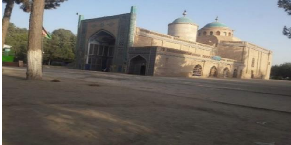
Figure 9. Historical view of Haji Shahid Masjid

According to the history of the Turkish language, it is the former name of Imam Sahab (Arhang) or the treasure in the chest of the soil. According to the survey of the technical board of the Department of Historical Abdat, the shrine of Hazrat Imam Sahib covers more than 29 acres. The flag of Hazrat Imam Sahib is raised every year with the participation of thousands of people including scholars, government officials and people from different parts of the country (Faqiri, 2024).