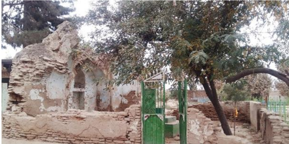
Figure 13. Historical view of Khwaja Mashhad Shrine