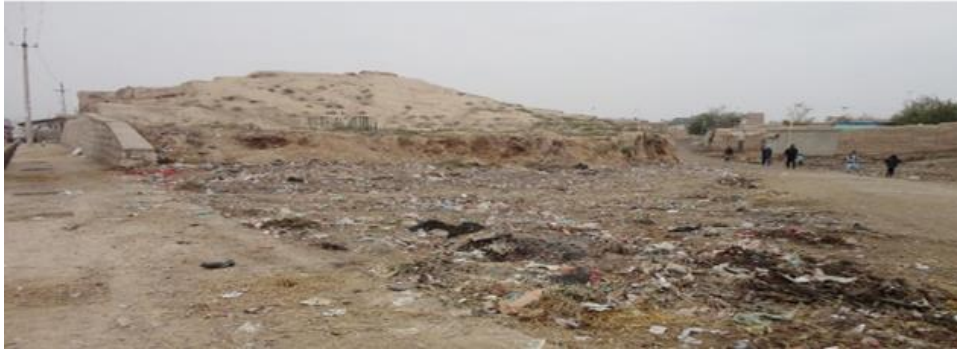
Figure 7. The ancient view of the top of the minaret in Kunduz province

This area is located half a kilometer west of the fence behind the fruit market, in the middle of which is a road built from south to north, in the west is the cemetery of the Islamic period and agricultural lands, on the east side is the fruit market, and on the north side is the newly built road and on the south side It is connected to residential houses where people live (Faqiri, 2024).