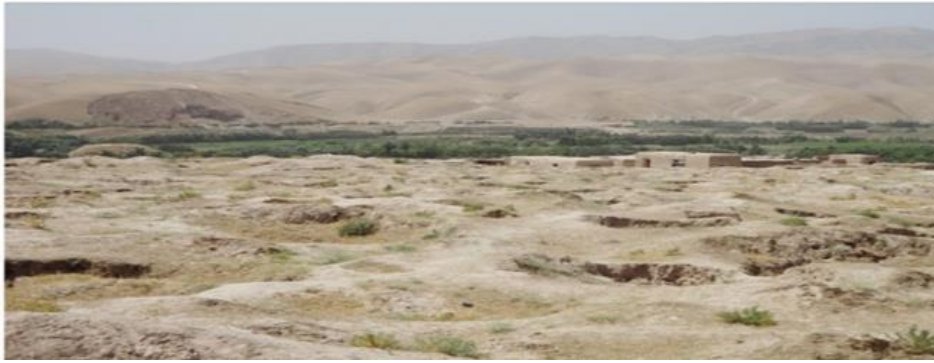
Figure 5. Historical view of Zhubin Hill, Ali Abad District, Kunduz Province

On the west side of it, the Baghlan Sea and the gate of the hill can be seen on the same side, which indicates that there is a house inside the said hill belonging to the historical era, which has not been discovered and explored in detail yet. This hill is of great historical importance and is considered one of the cultural heritages of this land, and the existence of this historically important hill is a proof of the bright history of Kunduz land (Ranjbar, 2023)