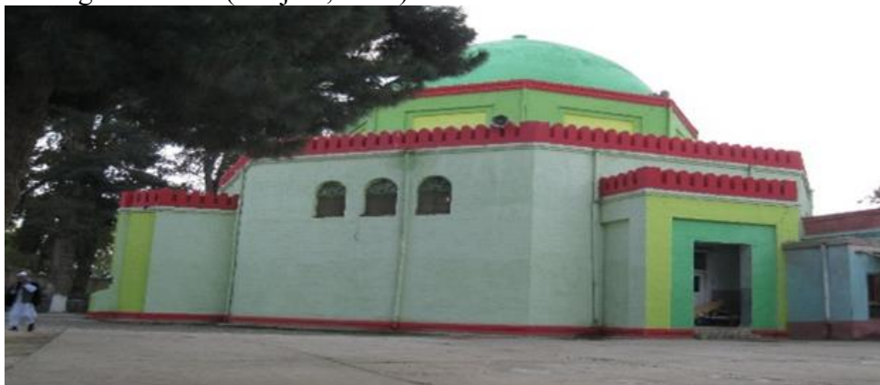
Figure 12. A view of Takharistan Grand Masjid

One of the historical monuments of the ancient land of Kunduz is the Takharistan Masjid. This Masjid, built in a relatively old style, is located in the center of the city of Kunduz. which is dome-shaped and made with baked clay and mud, there are long porticoes on the north and south sides, and many rooms are built on the east side of it, which are used by the students of today's Takharistan school. Its history reaches almost 100 years. This mosque was officially recognized under the title of Takharistan religious school in the Ministry of Education of the country in 1336, and since then, its allocation and budget have been paid by the central government (Ranjbar, 2023)