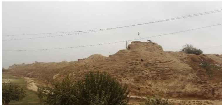
Figure 2. View from the historical hill

According to Tabari's history, Balahisar Kunduz was settled three thousand five hundred years ago by one of the Persian kings, who was Manouchehr, a great-grandson of Fereydun. This castle has four gates, two large and small fences and buildings and is located in the middle of a huge water ditch surrounded by a wall (Faqiri, 2024).