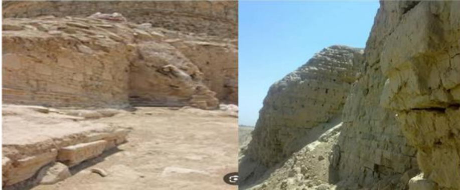
Figure 3. A view of the historical parts of Zal Castle

left side of the Amu Sea and on the right side of the Kunduz Sea, this historic fort Persistence has a strong position.