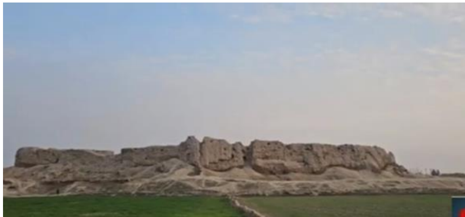
Figure 6. The ancient facade of the old Imam Sahib castle

The entrance gate of the castle is located to the west, inside these ranks, layers of ash have been noticed and the pottery fabrics of the pre-Islamic periods have been obtained. Moreover, the government building related to the local police has been constructed for the security of the area.