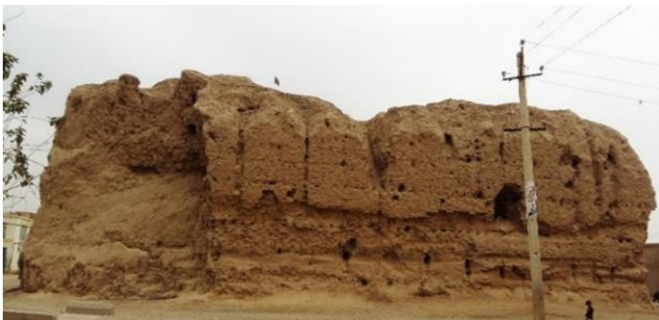
Figure 8. The southern view of the historic Forty Daughters hill

This pilgrimage is located one kilometer southwest of Kale Minaret. It is surrounded by agricultural lands and houses from the north, residential houses from the south and east, and Qalavartepe from the west. According to the guidance and report of the archeology board, the mentioned place has a cultural value that should be preserved. There is a legend about this pond that during the invasion of Genghis's army on the first day of Eid al-Adha while forty young girls were busy (Eid Gestak) and the army wanted to attack them, at that time they entered the Masjid and prayed for their salvation. From the Allah "SAW" with his wisdom turned this Masjid into an earthen hill and their prayers were accepted to Allah's door. The current condition of this hill is that the soil around it has been dug up by the people and this caused the failure of the huge part. It has become waterlogged, but despite repeated efforts to preserve the said hill, no attention has been paid to it and it remains in a dilapidated state (Ranjbar, 2023)