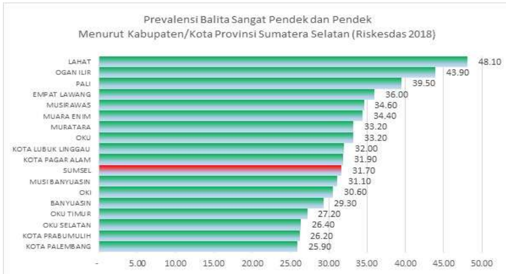
Figure 1. Prevalence of Toddler Stunting by Regency / City South Sumatra Province (Risksdas, 2018)

stunting in the city of Palembang in 2018 was 25.90% or lower than the regencies / cities in South Sumatra and decreased to 22.91% in 2019, can be seen in the following figure 1, 2, 3 and table 1.