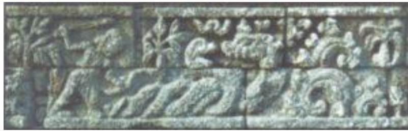
Figure 2. Two snakes wrapped around each other, heads facing each other. One of the snakes wears a crown ( Nagini ). Behind the slapping snake stands Angling Darma, swinging an arrow.