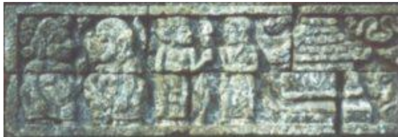
Figure 3. Angling Darma and his wife stand opposite each other, his wife carrying a shape of fire. On the back, two clowns are depicted facing each other.