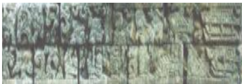
Figure 5. Men and women walking hand in hand, along with two clowns. They desired to visit a house complex surrounded by a fence and a paduraksa gate.