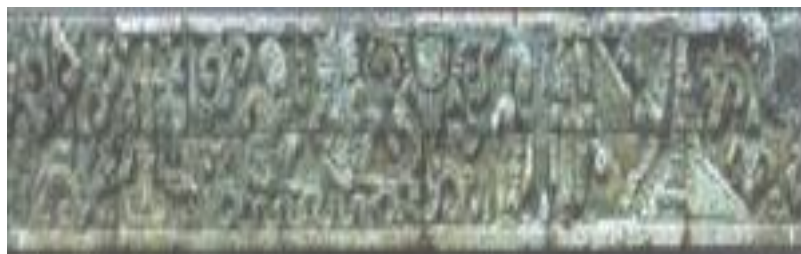
Figure 4. Batik Madrin shooting location for Angling Darma.